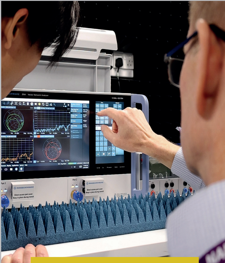
EXAMPLE HALF PAGE